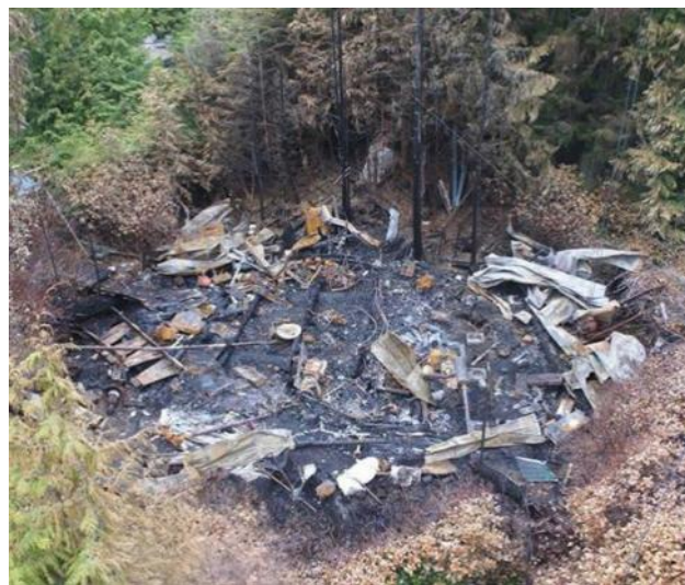
Shed after fire