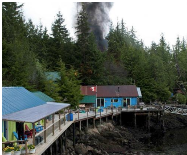
Smoke from fire in generator shed

We have new gift cards that can be purchased for your own use, or to pass on to a friend. The gift cards will have no expiry date and can be purchased in the following denominations: $100, $250, $500, $1000 and $2,500."