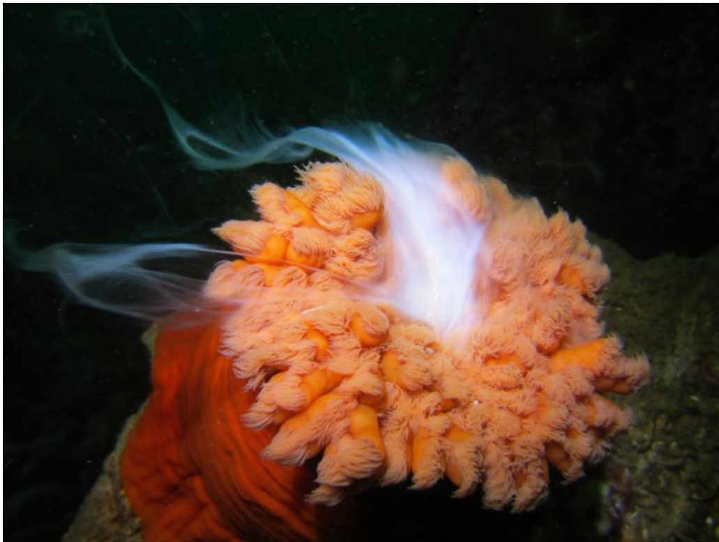
Plumose Anemone Releasing Sperm

take it and see what it looks like once downloaded, you may be surprised, as I have been many times over.