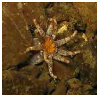
Ten-tentacled burrowing anemone

Where the ten-tentacled anemone has ten somewhat blunt tentacles, the jelly-dwelling anemone can have twelve somewhat long, tapering tentacles once it has reached its mature phase.