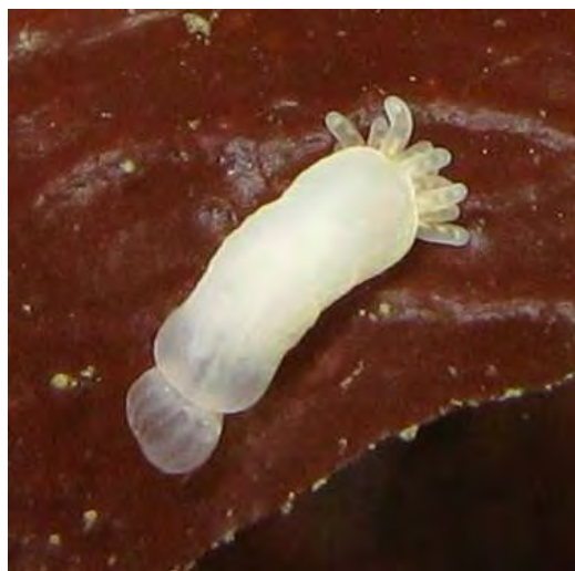
Jelly-dwelling anemone after leaving host

Once it matures, it drops from the jelly and begins its sedentary life in the sand. It is not known what becomes of the jelly once the anemone leaves its host.