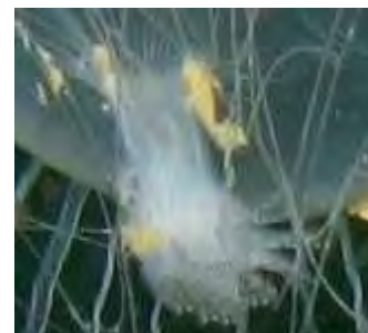
Jelly-dwelling anemone (immature)

Once it matures, it drops from the jelly and begins its sedentary life in the sand. It is not known what becomes of the jelly once the anemone leaves its host.