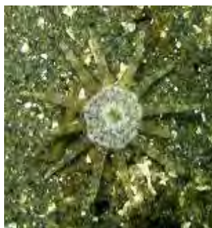
Jelly-dwelling anemone (mature)

The jelly-dwelling anemone begins life as a free-swimming larva. Once the jelly-dwelling anemone larva is eaten by a jelly – usually either a cross jelly ( Mitrocoma cellularia ) or a water jelly ( Aequorea spp.) , the larva becomes a parasite of the jelly and begins to feed on the jelly's stomach tissues.